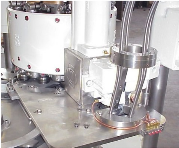
Ezquerra Single Cover Feeder mounted on a fully rebuilt Angelus® 60L.

This is the best word to describe the ease of installation and operation of our Single Cover Feeder kits. The kits are based on the design principles found on high speed can seamers that have been successfully used for many years. Ezquerra is the first and only company to incorporate this simple design to the Angelus® model 60L.